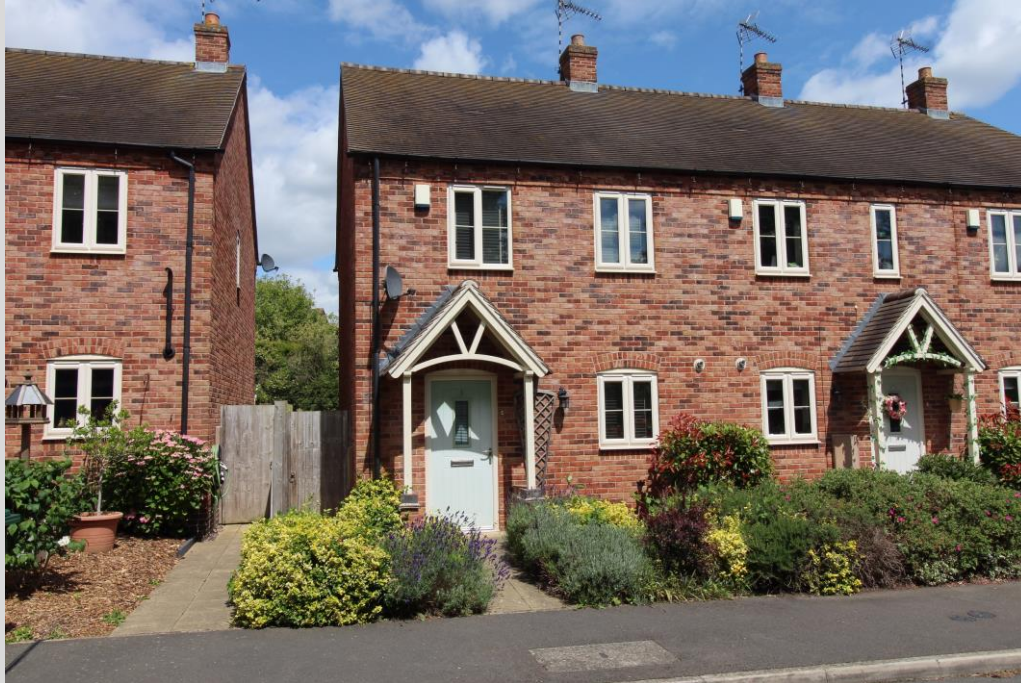
3 Old Plough Close, Weston-On-Trent Derby, DE72 2BS

Beautiful location sighted in an award winning development within the much sought after village of Weston on Trent. This modern three bedroom house has been sympathetically designed to blend in with it's established surroundings. There is off road parking for two vehicles under a stunning oak carport and a good size and very private rear garden. The property is fully UPVC double glazed and is gas centrally heated including underfloor heating throughout the entire ground floor. There is also a ground floor WC, a very nice fully fitted kitchen with space for a small dining table, lounge with dining space and double patio doors which lead out to the garden.